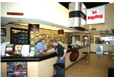
Our latest automotive dealer in Wales

As you have seen from this newsletter, Lifeline is a truly unique and exciting opportunity. We are currently looking for key distributors in your area to promote Lifeline product and enjoy true sales & growth potential.